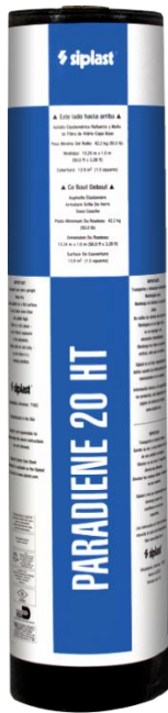
USES: BASE PLY FLASHING REINFORCING SHEET