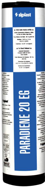
USES: BASE PLY FLASHING REINFORCING SHEET